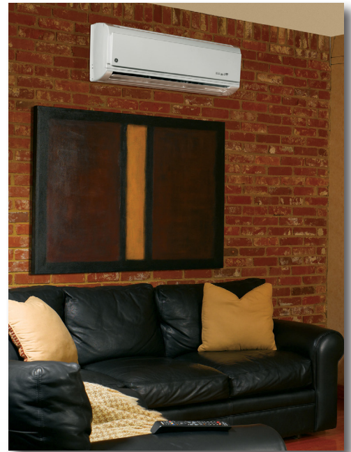
The indoor units can be suspended from a ceiling, mounted flush into a drop ceiling, or hung on a wall.

DHPs have been around for over 30 years and are used widely throughout the world.